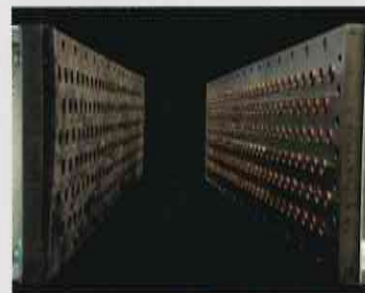
HEAVY-DUTY GASKET ENSURES TIGHT SEAL.