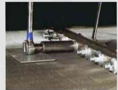
SECTIONS ASSEMBLE WITH HAND TOOLS.