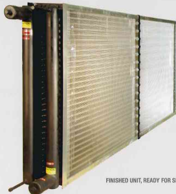
FINISHED UNIT, READY FOR SERVICE.